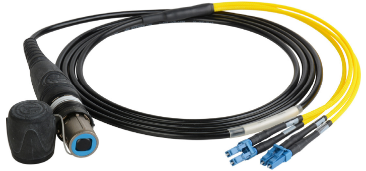
HF-OC4S-LC-0010 opticalCON Quad Singlemode LC Connector Breakout