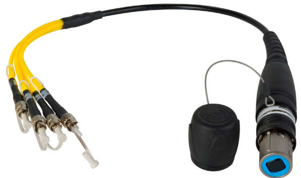
HF-OC4S-ST-18IN opticalCON QUAD to Quad ST Singlemode Fiber Optic Breakout