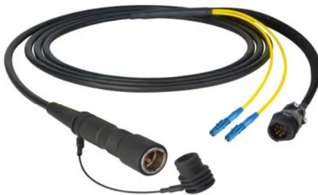
Duplex LC with Power