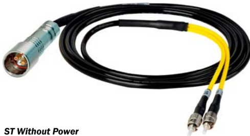
ST Without Power