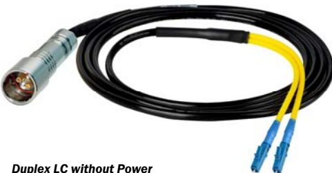
Duplex LC without Power