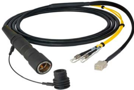
ST With Power