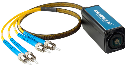
QUAD to Four (4) ST Breakout Adapter - Singlemode