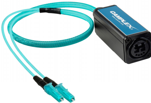
DUO to Duplex (2) LC Breakout Adapter - Multimode

The lightweight, yet rugged, design makes this adapter ideal for strapping to cameras and other gear.