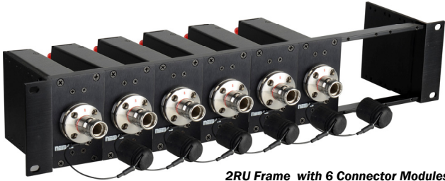
2RU Frame with 6 Connector Modules