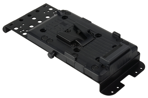
BLACKJACK-SAN3 (IDX Battery Mount)