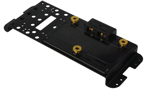
BLACKJACK-SAN6 (Anton Bauer Battery Adapter)