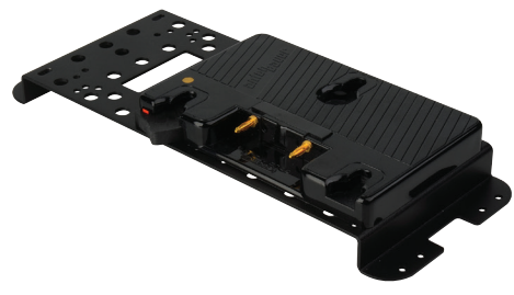
BLACKJACK-SAN5 (Anton Bauer Battery Mount)