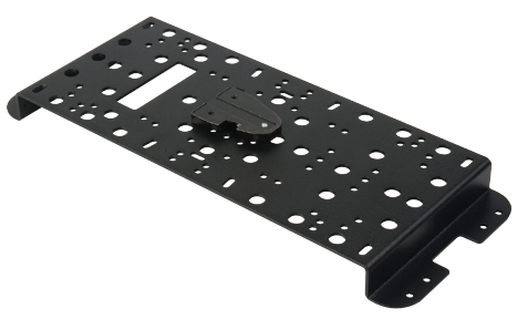
BLACKJACK-SAN2 (IDX Male V-block)