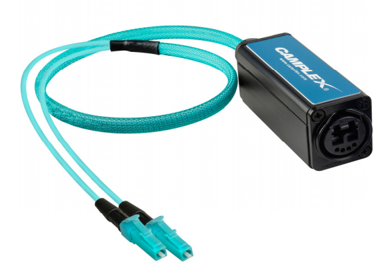
DUO to Duplex (2) LC Breakout Adapter- Multimode

The lightweight, yet rugged, design makes this adapter ideal for strapping to cameras and other gear.