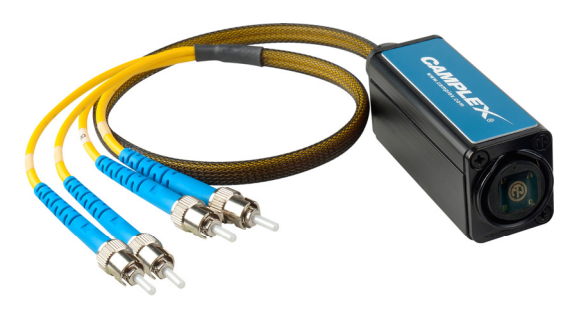
QUAD to Four (4) ST Breakout Adapter - Singlemode