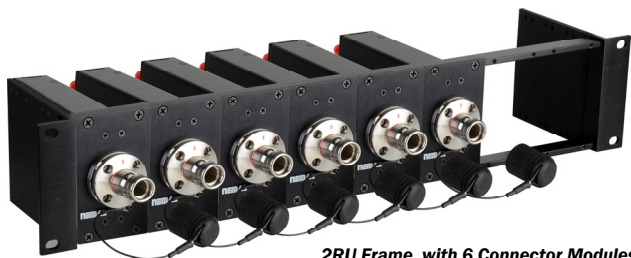
2RU Frame with 6 Connector Modules