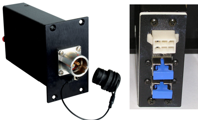
SMPTE EDW Jack to 2 ST Fiber & 6-Pin AMP for 2RU HYMOD Systems